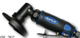
5205-2EC Angle Grinder