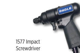
1577 Impact Screwdriver