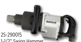
2S-290015 1-1/2" Swing Hammer