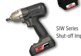
SIW Series Shut-off Impact