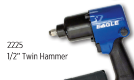
2225 1/2" Twin Hammer