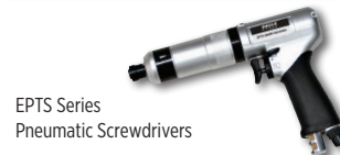
EPTS Series Pneumatic Screwdrivers