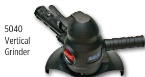
5040 Vertical Grinder