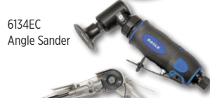
6134EC Angle Sander