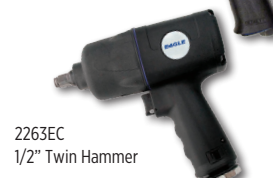
2263EC 1/2" Twin Hammer