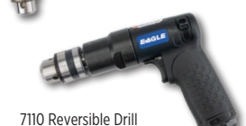
7110 Reversible Drill