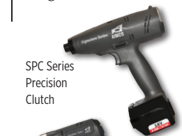
SPC Series Precision Clutch