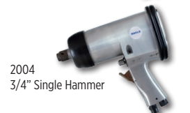
2004 3/4" Single Hammer