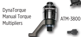
DynaTorque Manual Torque Multipliers